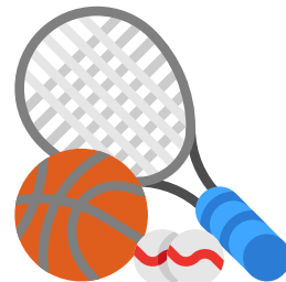
Sports & Fitness